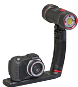
Micro 3.0 Pro 3000 w/ light

Get brighter, more colorful results by expanding your underwater camera system. The modular Flex-Connect® arms, grips and trays easily fit together to create popular configurations. The following camera sets are available complete, including camera and lighting.