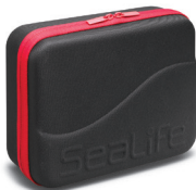
Sea Dragon Case (SL942)