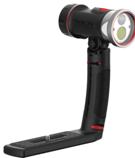
Sea Dragon 3000SF Pro Dual Beam Light (SL679) with Flex-Connect® Grip (SL9905) and Single Tray (SL9903)