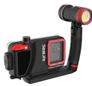
SportDiver Pro 2500 w/ light