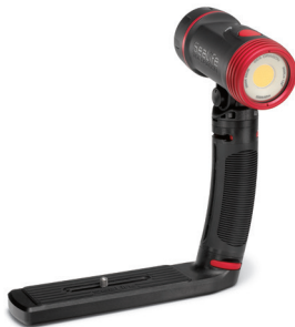
Sea Dragon 2500F Light (SL671) with Flex-Connect® Grip (SL9905) and Single Tray (SL9903)