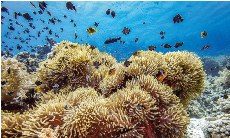
Shooting up and adding a layer of blue water adds contrast.

Try and shoot upwards from below the subject so you get a blue water background and better contrast. Get the entire subject into your picture frame. Don't cut off the hands, fins or head of your subject. You can always crop your image later on your computer if you want.