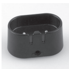
Charging Tray (SL98311)