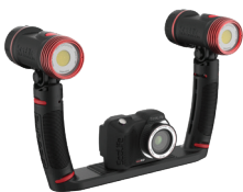
Micro 3.0 Pro 5000 w/ 2 lights