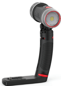
Sea Dragon 2000F Light (SL677) with Flex-Connect® Grip (SL9905) and Micro Tray (SL9902)