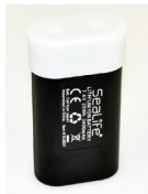
Li-ion Battery (SL9831)