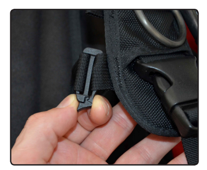
Fig. 15 Fig. 16 Fig. 17