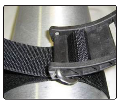
Fig. 5 Fig. 6

• With the band tight, weave the band through the top slot (Labeled 4) of the buckle from inside to outside ( Fig. 7). Pull tight and fold the buckle over so it snaps against the tank ( Fig. 8, 9). Now attach remaining webbing to the webbing against the tank using the self gripping patch ( Fig. 10).