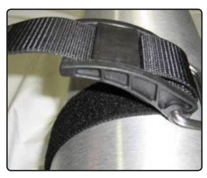
Fig. 7 Fig. 8 Fig. 9